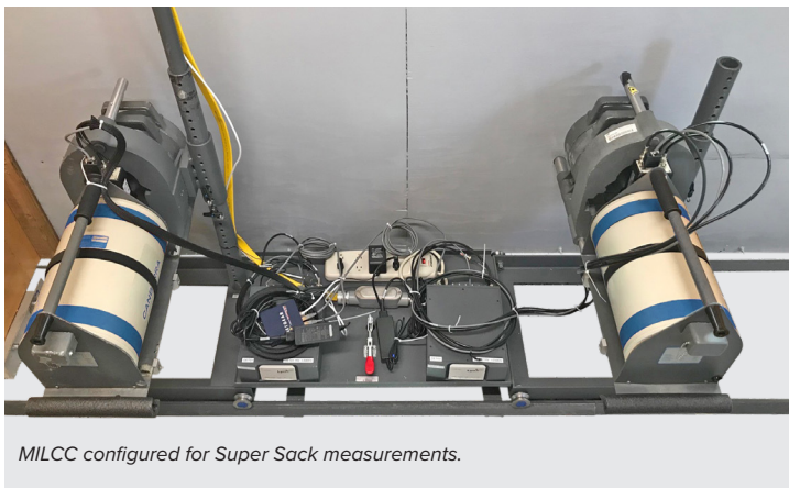
MILCC configured for Super Sack measurements.

Mirion's ISOCS mathematical efficiency calibration software is used. This eliminates the need to purchase, manage, and handle radioactive sources to perform traditional efficiency calibration measurements. The ISOCS software can model a wide range of waste containers, waste matrices, and container-detector geometries. Each germanium detector is shipped with an ISOCS intrinsic efficiency calibration specific to that detector. The ISOCS efficiency calibration approach has been accepted by the Department of Energy, the Environmental Protection Agency, and many state environmental agencies.