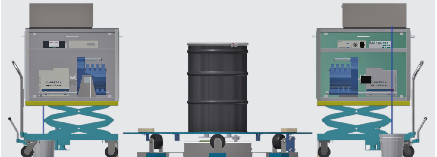
Side view of 55 gallon drum measurement configuration with large turntable.