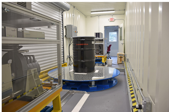
MILCC deployed as a drum and box counter in a trailer.