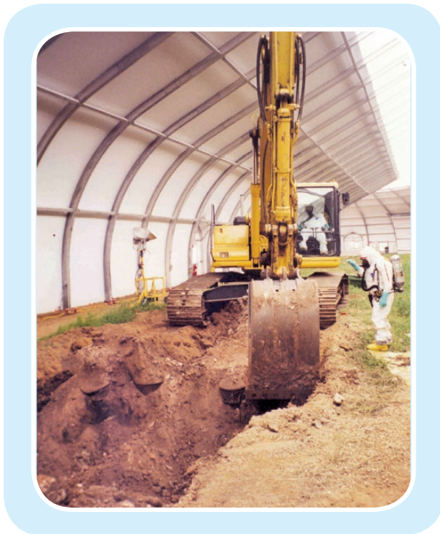
“Trench One” Excavations and MCLS operations

The goal of this project was mainly to support the accelerated closure of Rocky Flats Environmental Technology Site (RFETS) and reduce the overall cost.