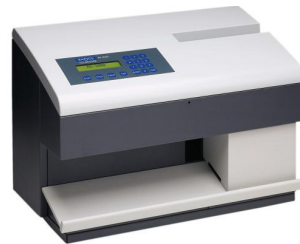
IR2000 TLD irradiator