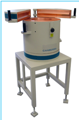
Top doors are linked – so they open and close together