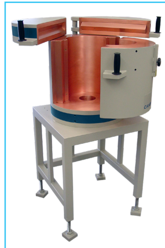
Front door provides full-area access