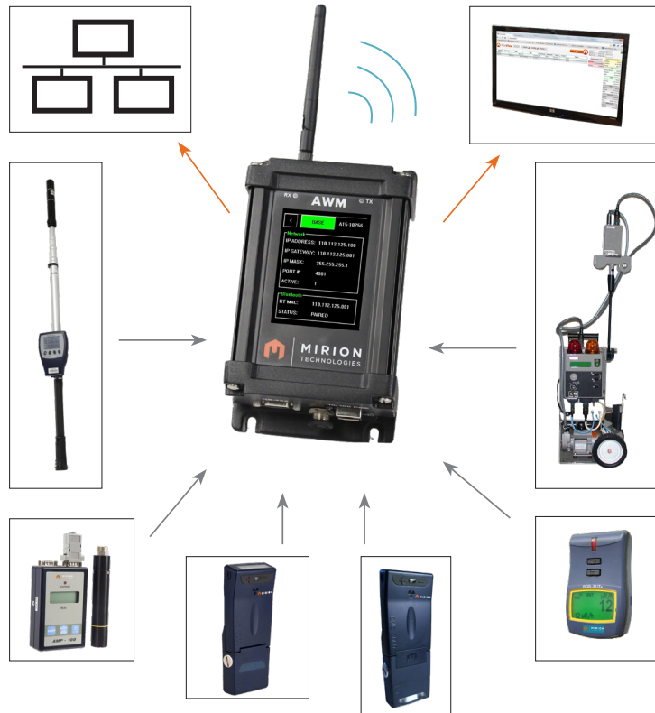
AWM and Mirion Telemetry Network