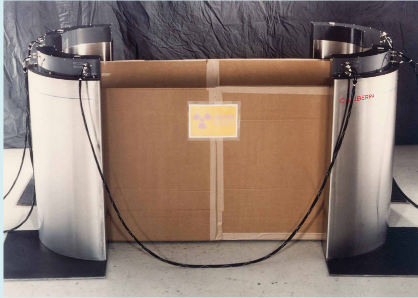
The WM3500 system can be used with larger objects by separating the pillars.