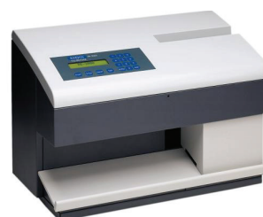
IR2000 TLD irradiator